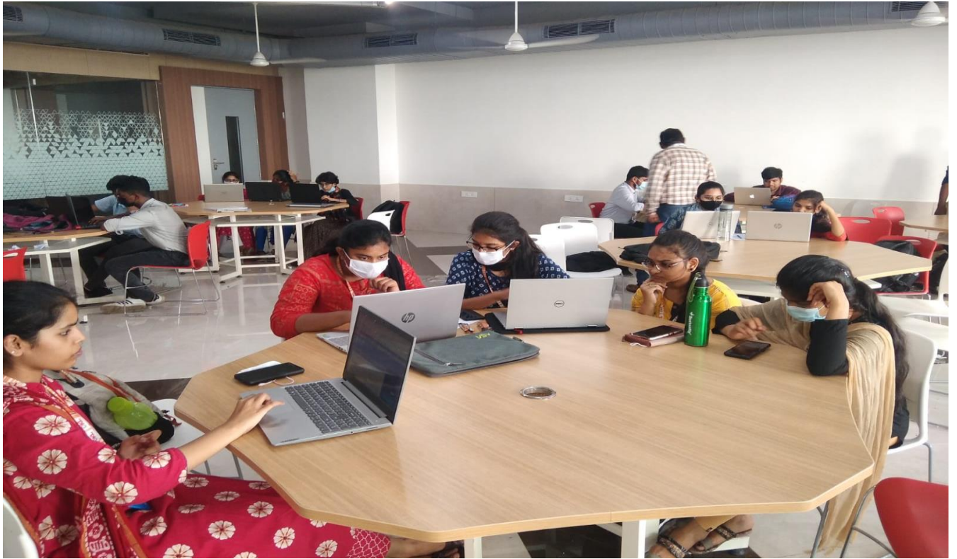
Pics: Professional society activity: The Big Bull- Finance Game on 24-03-2024