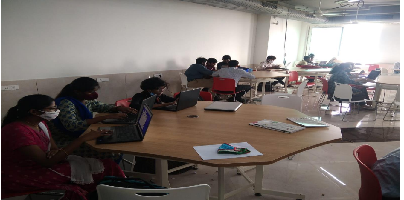
Pics: Professional society activity: The Big Bull- Finance Game on 24-03-2024